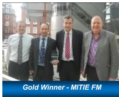
Gold Winner - MITIE FM