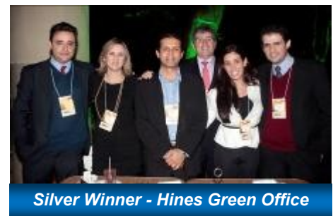
Silver Winner - Hines Green Office