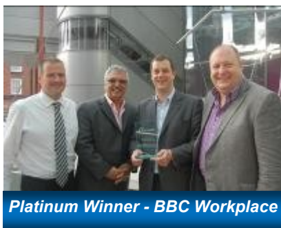
Platinum Winner - BBC Workplace