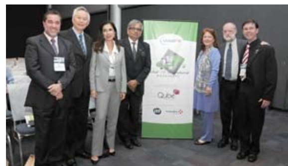
ABRAFAC Workshop Speakers