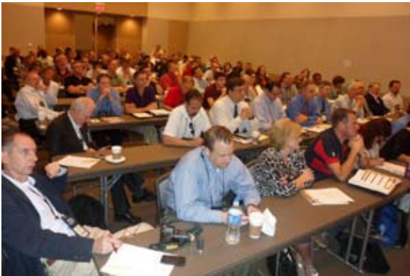
US Workshop Audience

The last International Workshop of 2011 coincided with the International Facility Management Association's (IFMA) World Workplace Conference & Expo 2011 held in Phoenix, Arizona from 26th to 28th October. The Global FM International Workshop took place on Friday, 28th October and gathered 130 people.