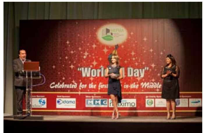
MEFMA World FM Day celebrations